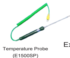
Temperature Probe (E1500SP)