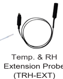
Temp. & RH Extension Probe (TRH-EXT)