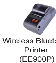
Wireless Bluetooth™ Printer (EE900P)